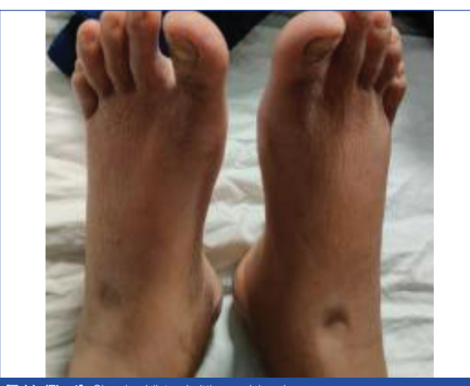
[Table/Fig-1]: Showing bilateral pitting pedal oedema.

On examination, pulse was 78 beats per minute, regular in rhythm with normal volume and no special character, blood pressure was 120/70 mmHg in right arm supine position, bilateral pedal oedema was present [Table/Fig-1], there was no pallor, icterus, cyanosis or lymphadenopathy. On systemic examination, there was dull note present on percussion in bilateral infrascapular region with diminished air entry in bilateral infrascapular region. Abdomen was soft and tenderness was present in epigastrium, fluid thrill and shifting dullness was present. Heart sounds were normal and patient was conscious and oriented. Patient was admitted in intensive care unit and investigations were carried out.